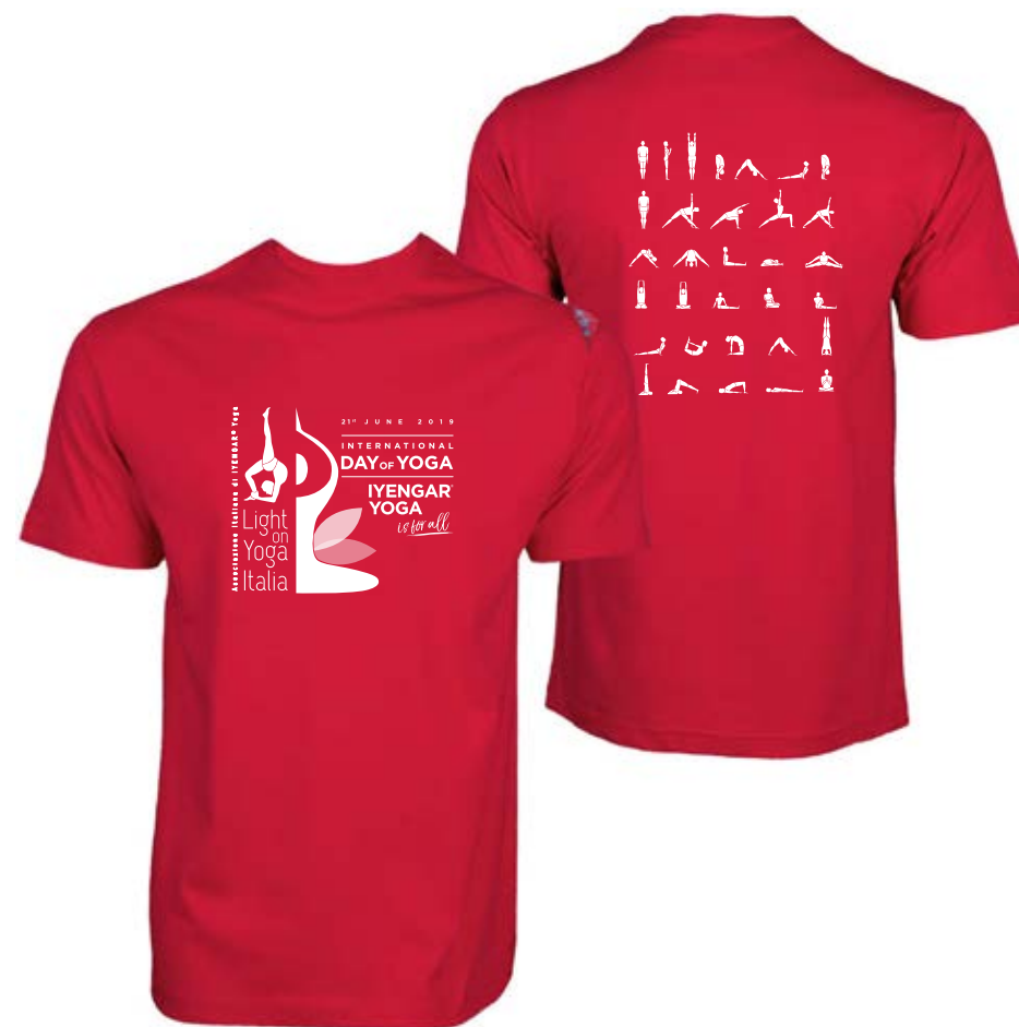
alternativa stampa in bianco su t-shirt rossa