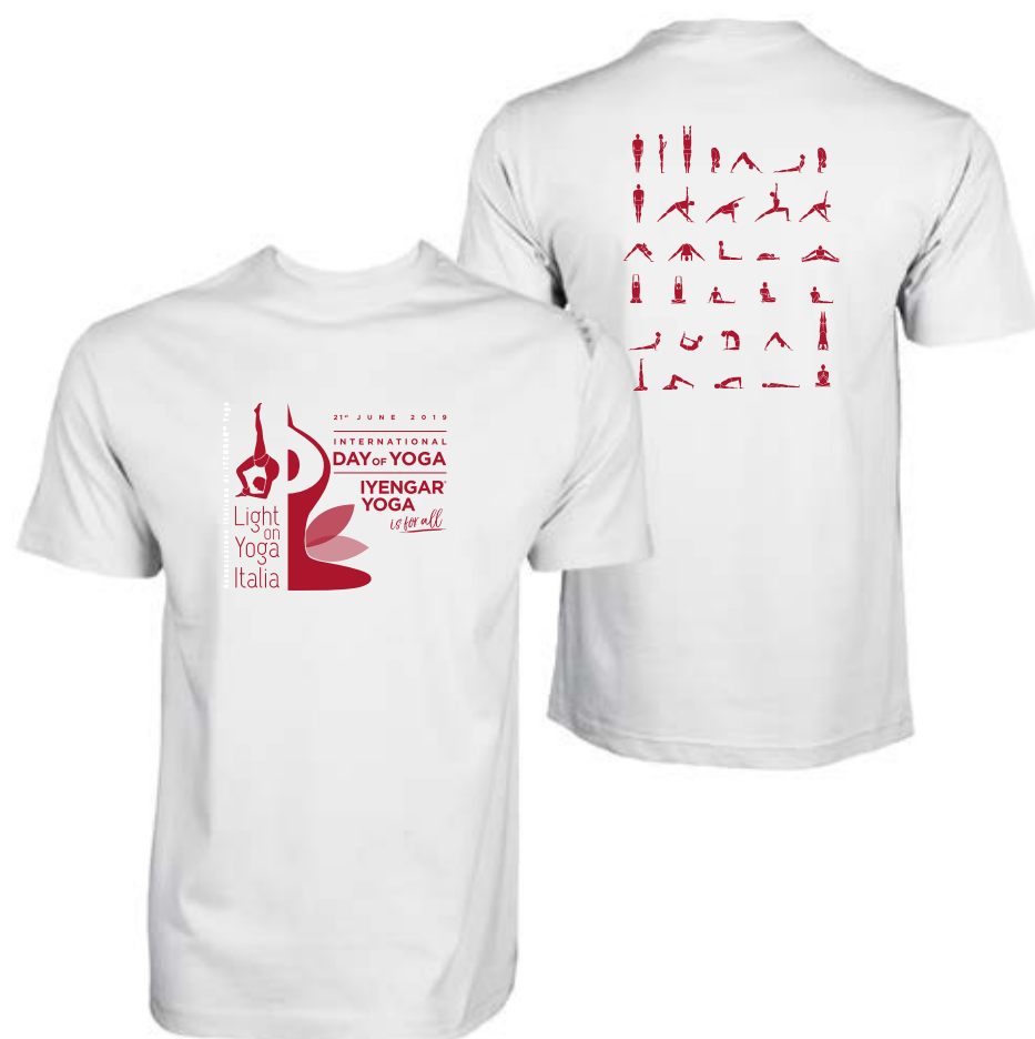
alternativa stampa in rosso su t-shirt bianca