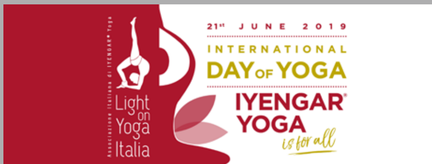
Cover evento Facebook