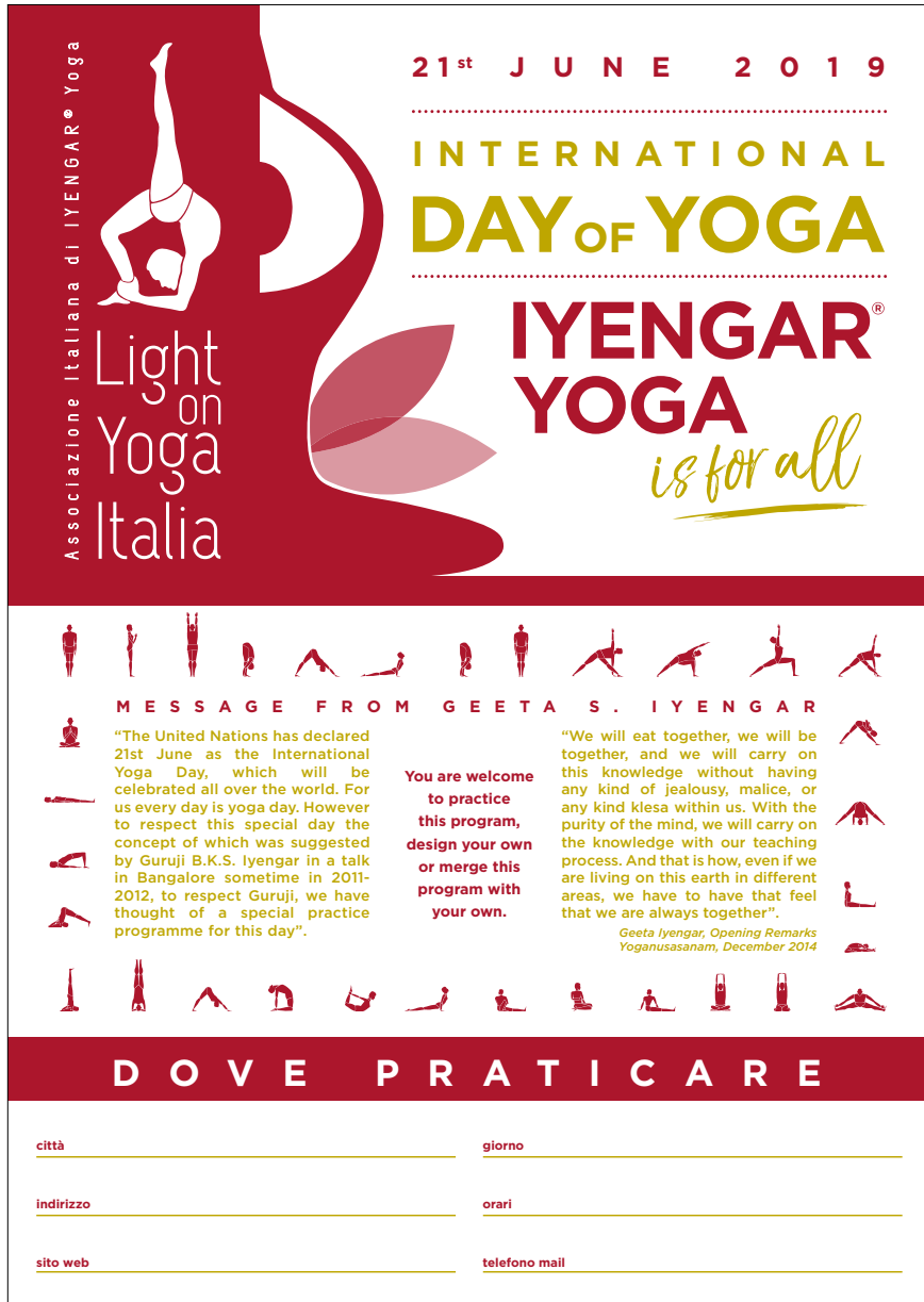
Locandina-2 personalizzabile a mano